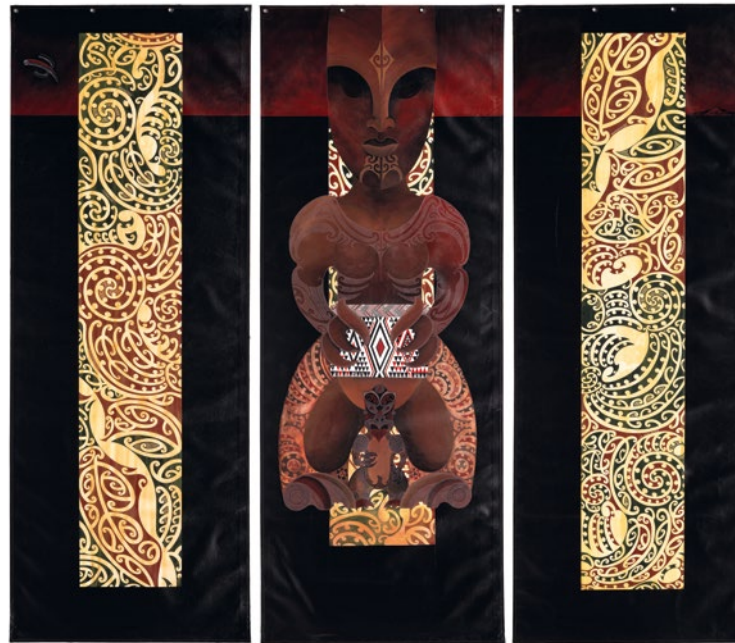
Hiwirori Hatea, Hinehakirangi, acrylic on canvas, 264 × 233 cm, 2017

were acquired in London between 1825 and 1914, where their trail is lost. Often, the question of their origin can only be approached based on certain clues.