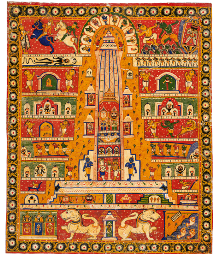
Jagannath, Balabhadra and Subhadra, Orissa, 2nd half of the 20th century, paint, canvas, 73.8 x 60 cm, inv. no. 08-329 293

Registration at kunstvermittlung@mfk-welttoffen.de