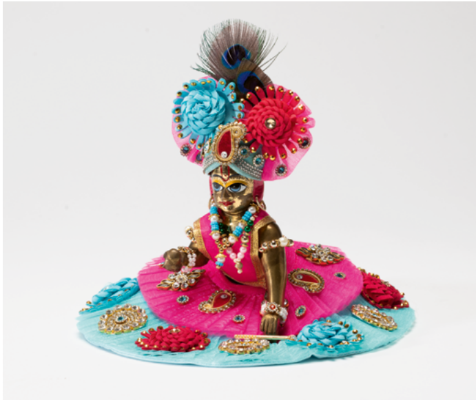
Krishna as a baby, clothed, Delhi, 2025, metal alloy, synthetic fibres, glass stones, wire, peacock feather, 20.5 x 25 x 23 cm

The starting point of the exhibition is Krishna's life story, with impactful descriptions of the most important episodes. The focus then shifts to religious practice – ranging from everyday worship at home to major festivals such as Janmashtami (the birth of Krishna) and the Holi Festival of Colours. The final part of the exhibition shows Krishna in global pop culture.