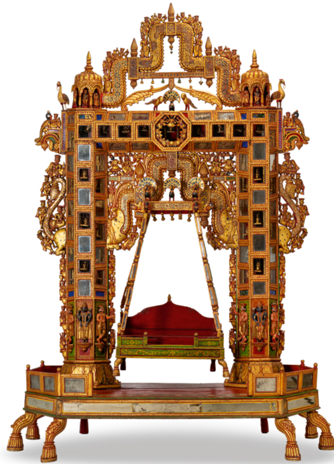
Swing for Krishna figures, Jaisalmer, late 19th to 20th century, wood, glass, gold leaf, 265 x 180 x 86 cm, inv. no. 98-320 103

The exhibits originate from various epochs, regions and contexts and extend from historical objects to contemporary forms of expression. They include a magnificent swing and a portable folding altar as well as popular poster prints and contemporary figures. Five precious, large-format religious wall hangings (pichwais) are a particular highlight.